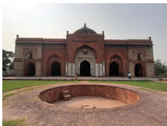
Qila-i-Kuhan Mosque with ablution tank in front