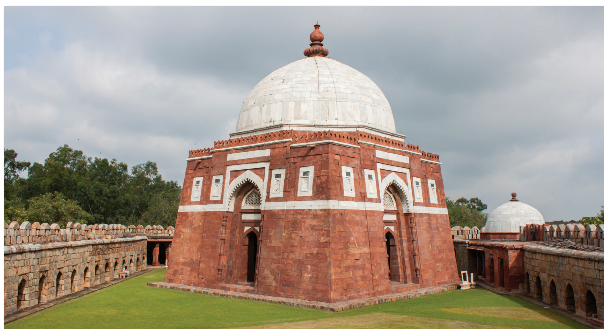
The tomb of Ghiasuddin and Muhammad Bin Tughlaq