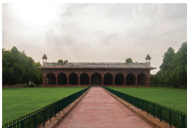
View of Diwan-i-Aam from Naubat Khana in the Red Fort complex