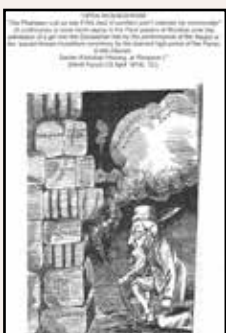
Susaune Briere Photo courtesy: Parsiana Publications